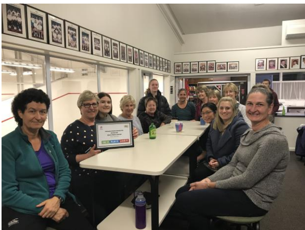
Burnside ladies; known for their great suppers, which are often homemade

'Rangiora are easy-going and friendly chaps, very hospitable, caring and courteous. Games are arranged and conducted in good manner (no dramas even if refs make mistakes in 'Let' calls) and food is always nice'.